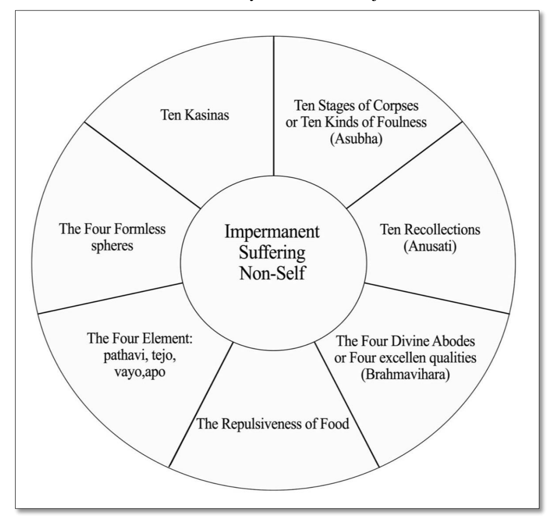
Table 7: Forty Meditation Objects